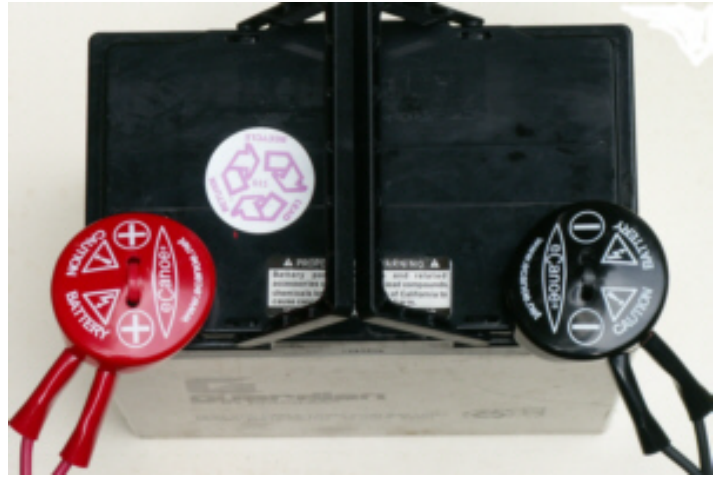
12V / 55 A-H Battery with battery clips connected.

Made in the USA by eCanoe, LLC www.ecanoe.net www.ecanoe.org write comments to: info@ecanoe.net